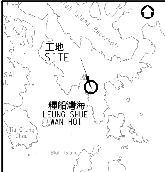
索引圖 KEY PLAN SCALE 1 : 100 000